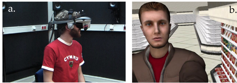
FIGURE 1 | (a) Virtual reality set-up used for this experiment. (b) Portrait of the virtual agent (VIRTUO) and the virtual supermarket in which the experiment took place.

Mimicry condition, the previous participant's head movements were rendered. In addition to moving his head, VIRTUO also moved his mouth according to the volume envelope of his (recorded) speech, and blinked his eyes on a random cycle, across all conditions. The conversation lasted 10–15 min.